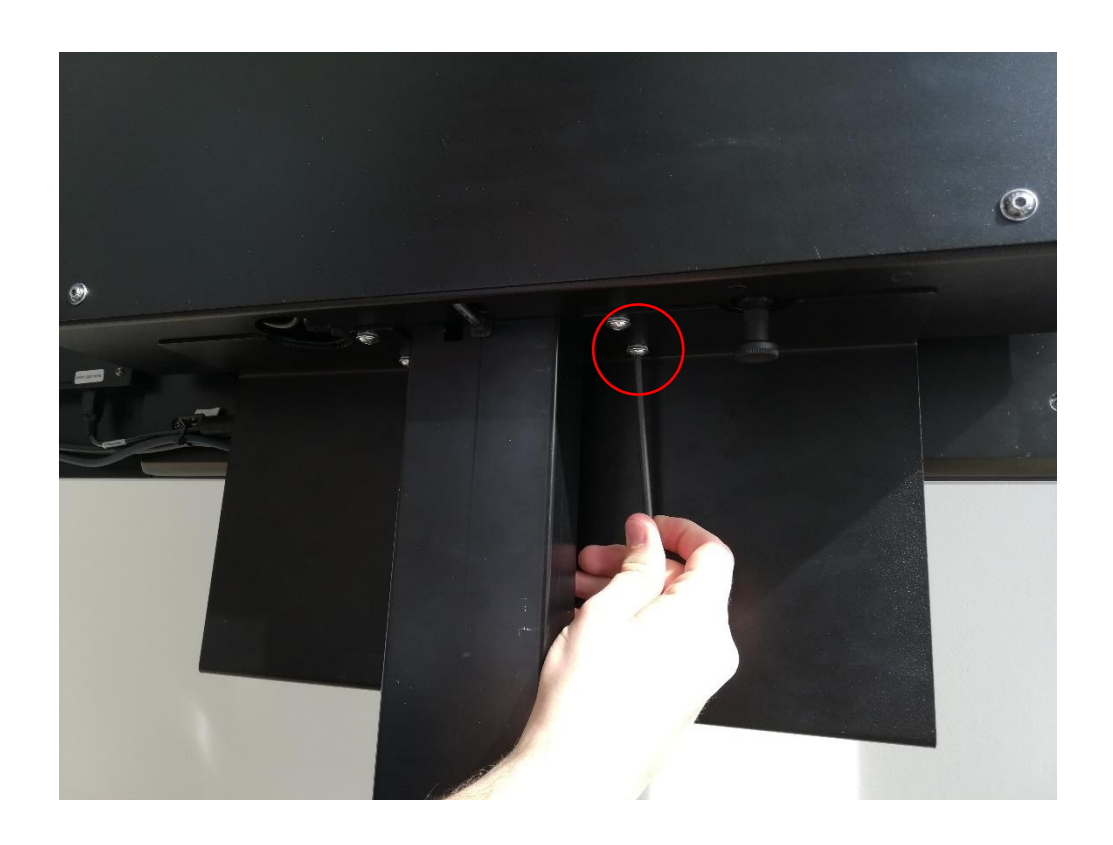
Step 7: The storage shelf is now mounted on the monitor box.